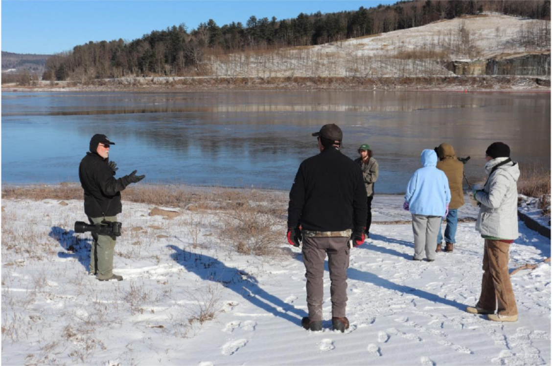
National Eagle Count at Mine Kill State Park Viewing Site #14, January 8, 2022