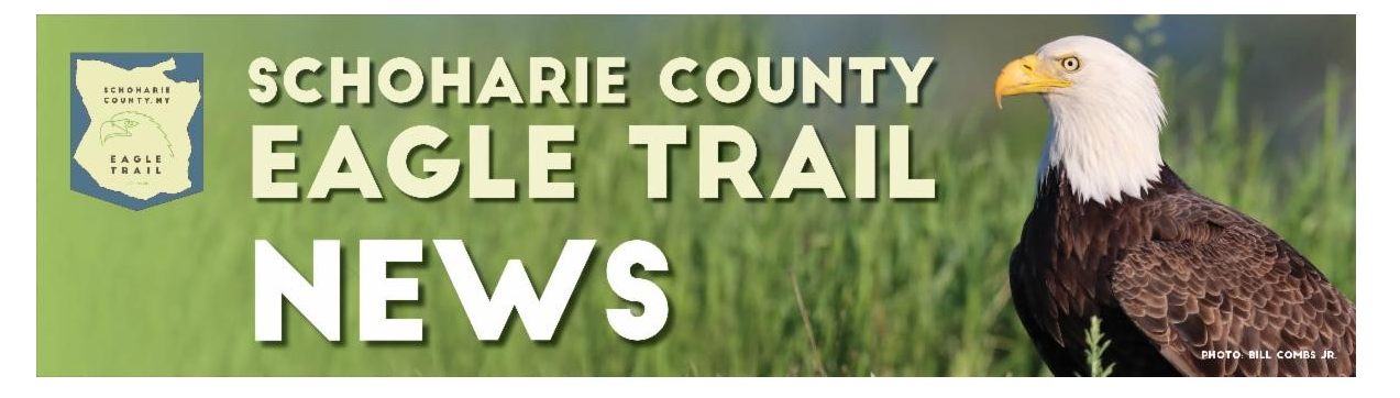
This edition presented by the Mountain Eagle Newspaper